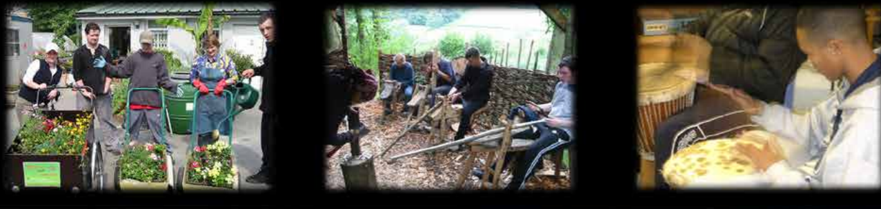
A plant delivery for a local supporter's garden; the green woodworking course in the Malvern Hills; drumming workshop with Brockwell Park Drummers.